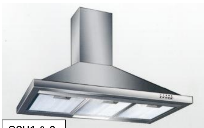
QCH1 & 2

These cooker hoods are designed to extract unpleasant odours from the kitchen; they are not intended to extract steam.